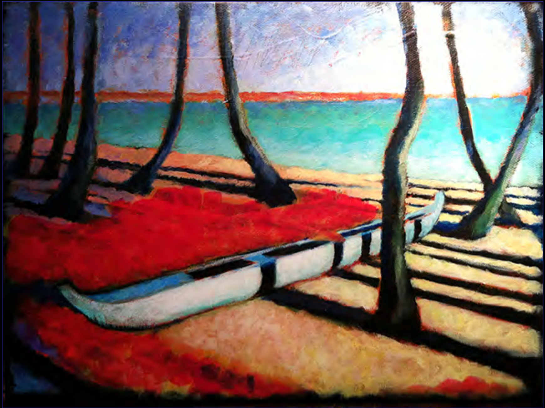
Making the horizon level; adding red to the filled-in part.