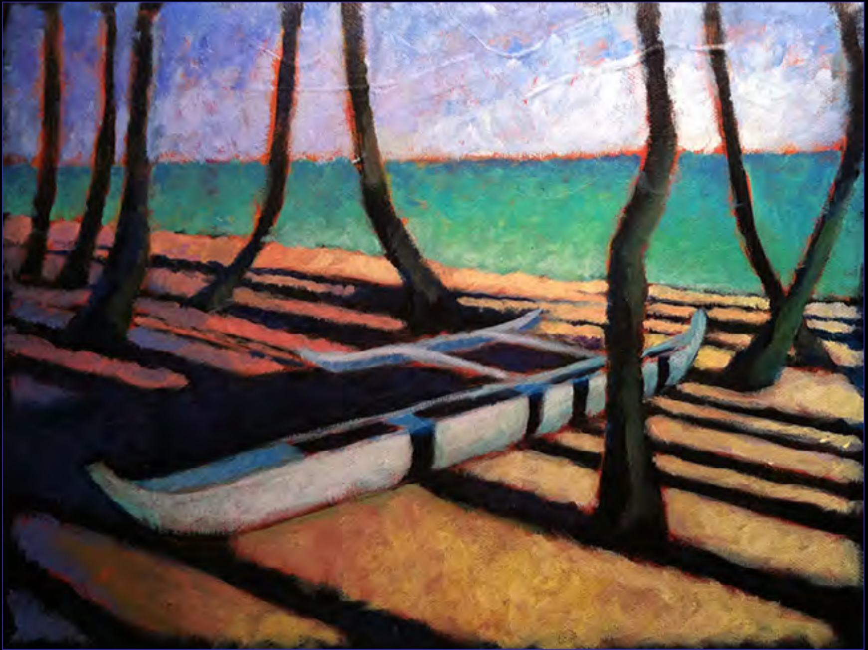
Darken the sands, rough in the sky and water....