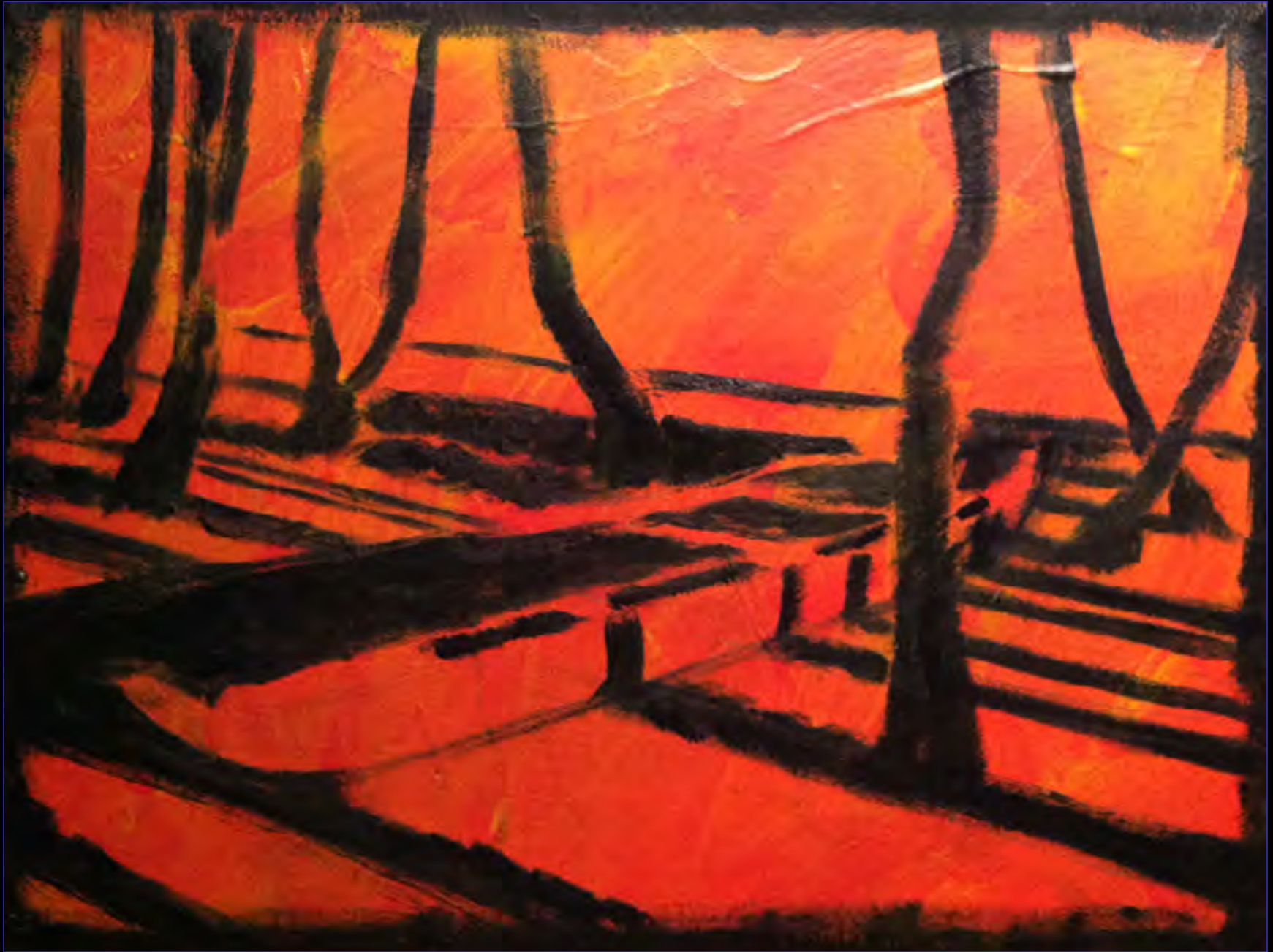
I do loose black outlines to create a 'feel' of the scene.