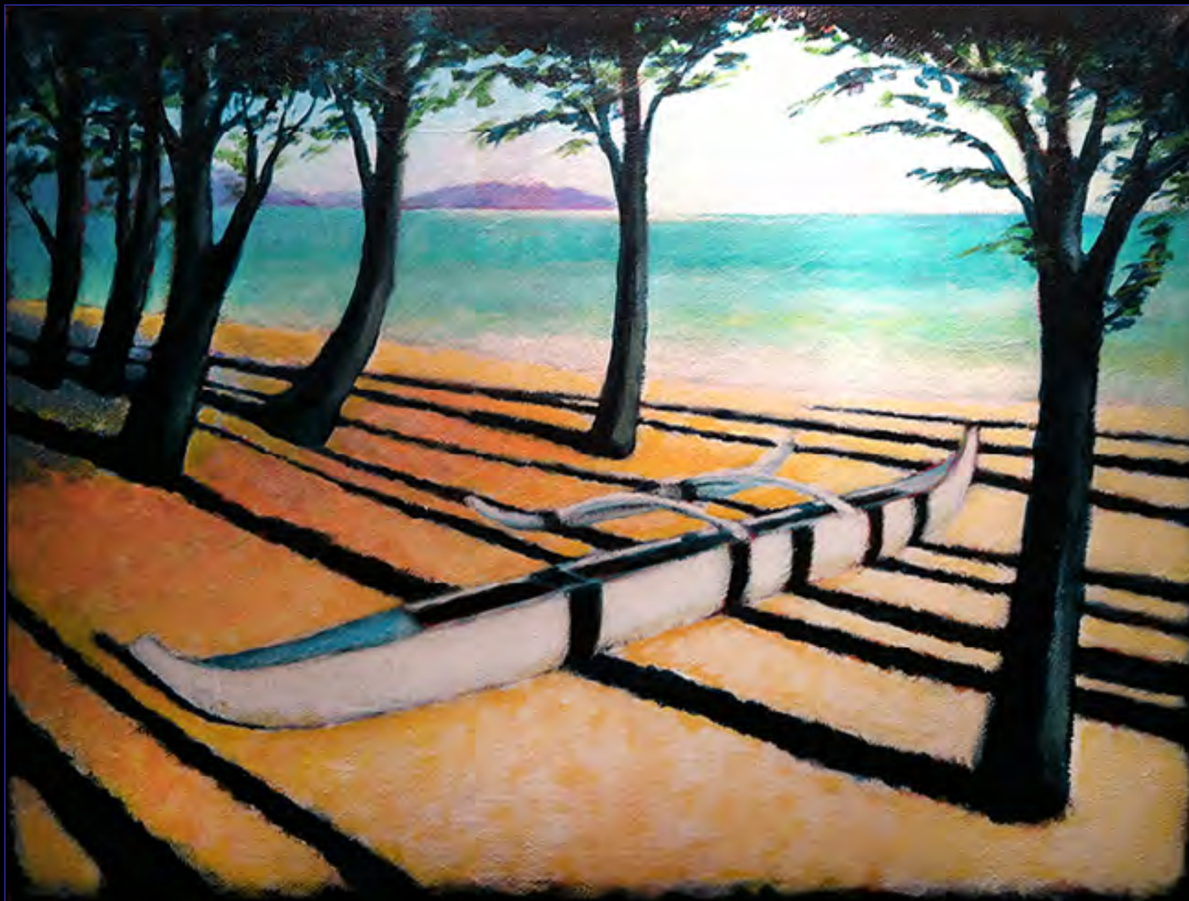
Darker sands, added leaves to trees....