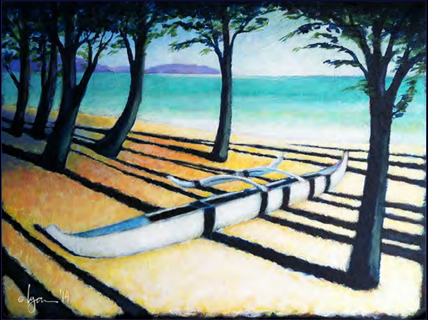
The finished painting. Follow the process on the next pages....