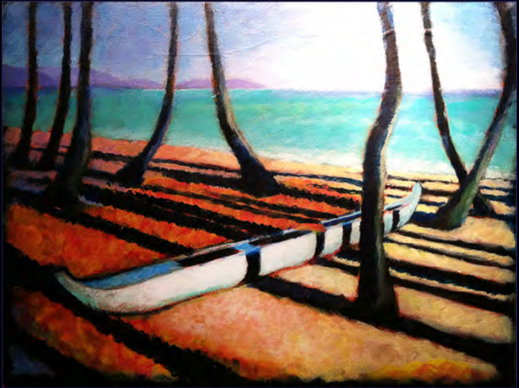
Sketching the shadows back in.