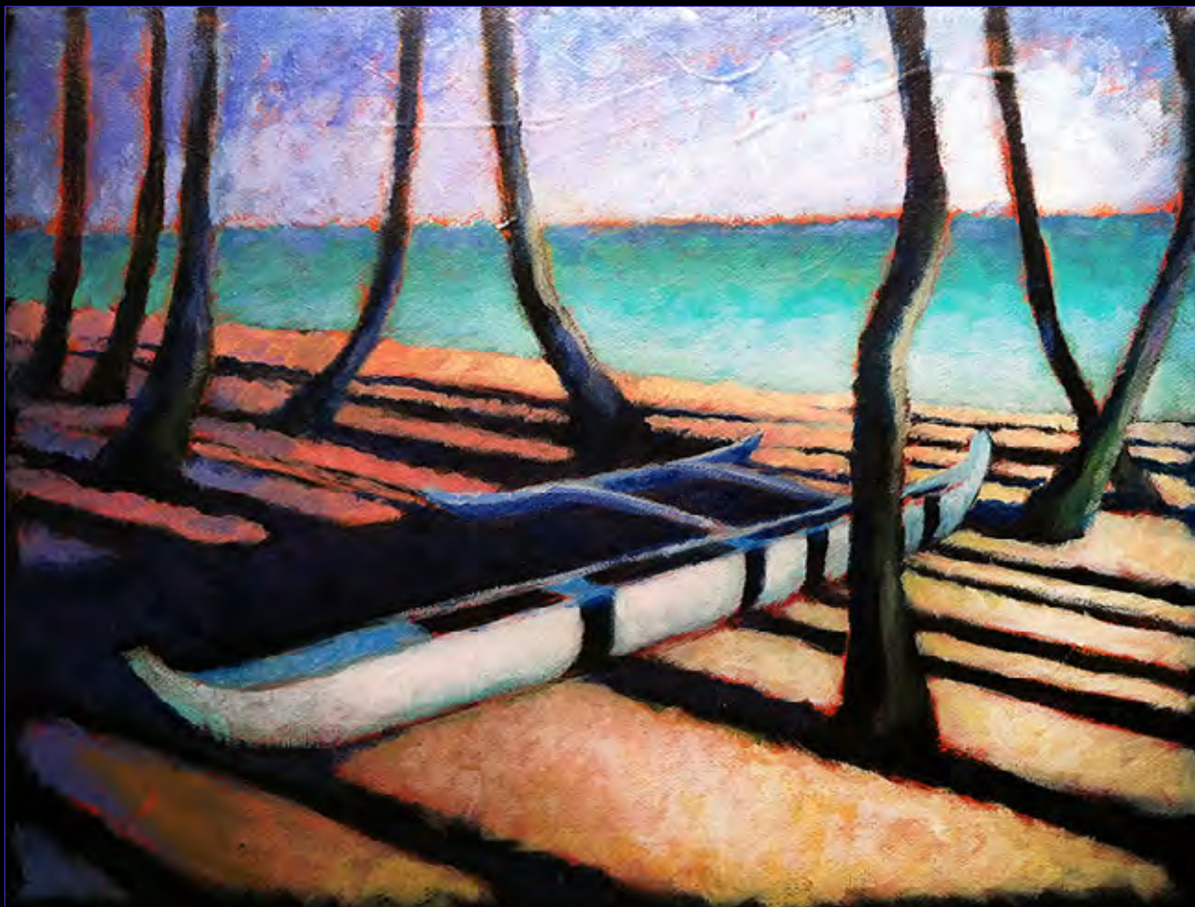
Refining the trees a bit, darkening the pontoon....