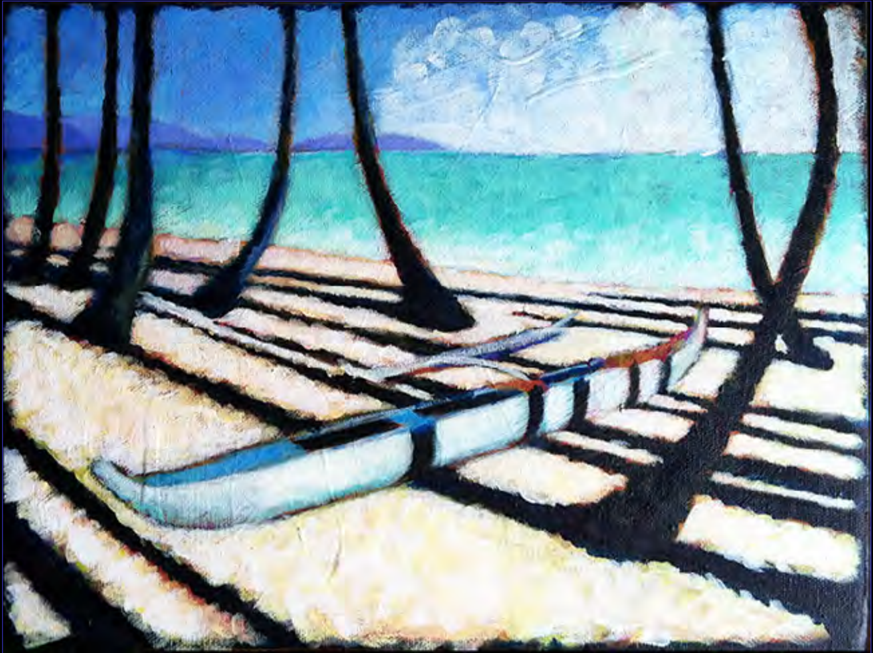
Trying a very white sand, redoing the trees, more contrast in the sky.