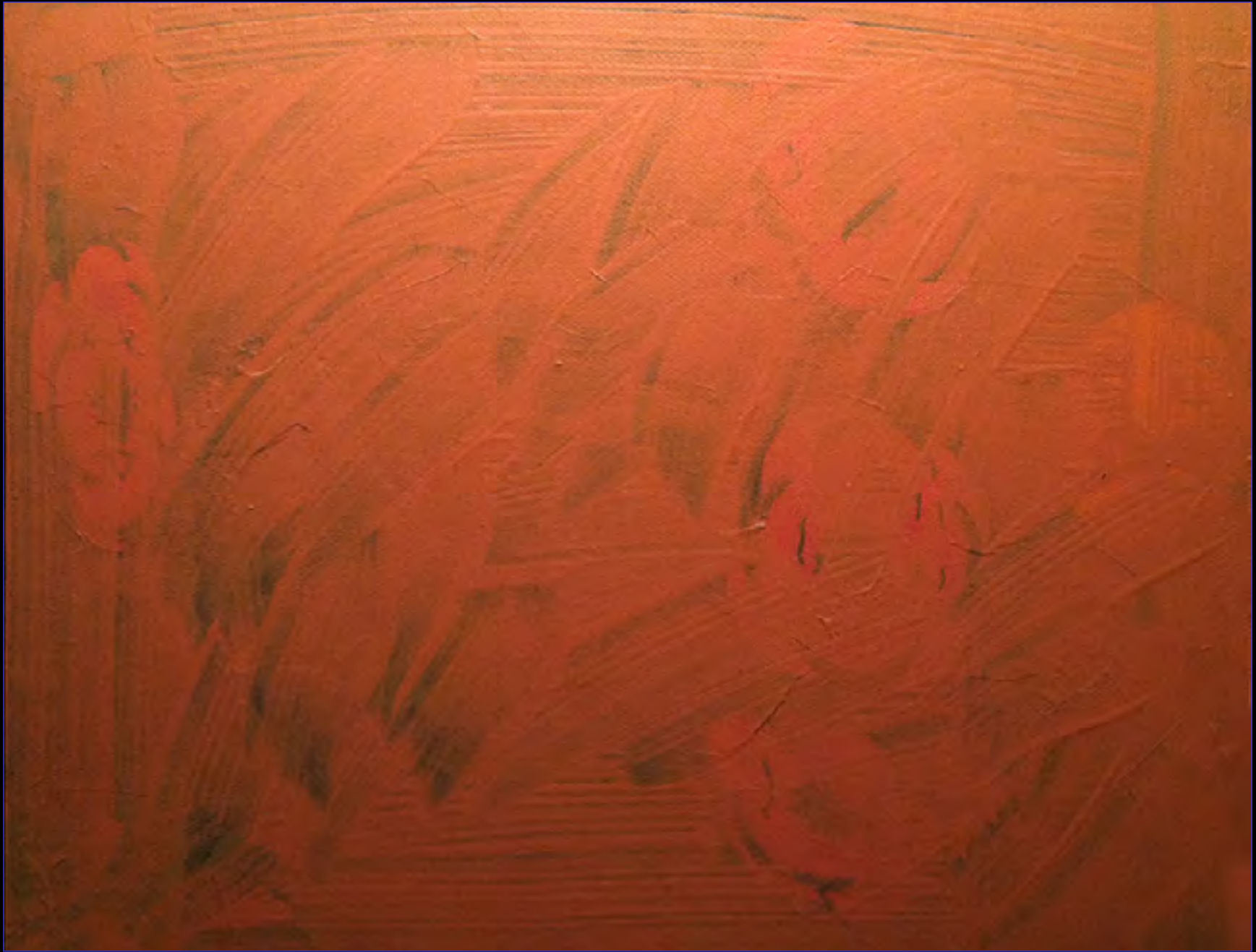
The basic start: white Gesso on the canvas. It has Burnt Sienna in it for a neutral color background, plus thick for a little texture.