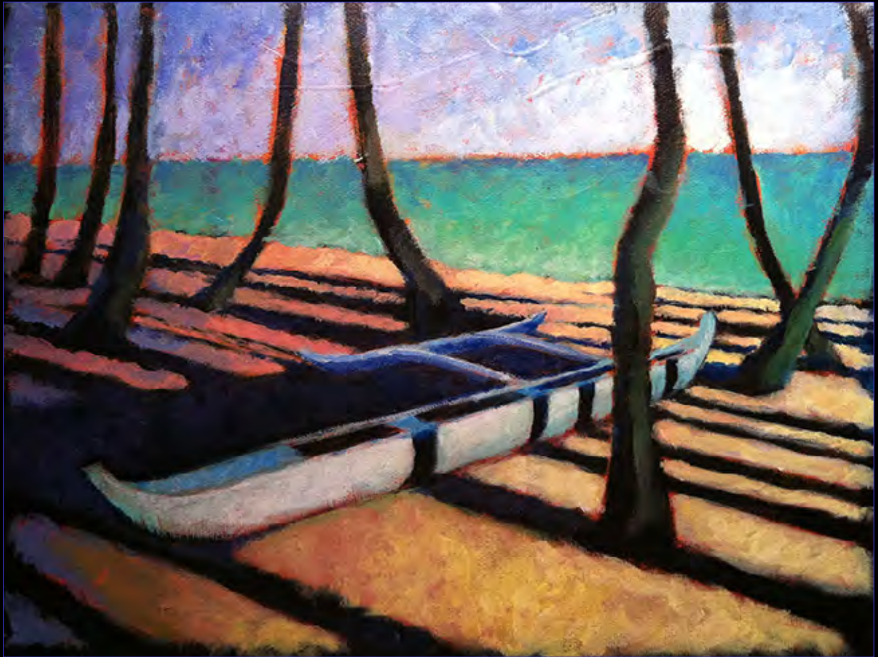
Lightening up the foreground with yellow, fooling around with the pontoon....