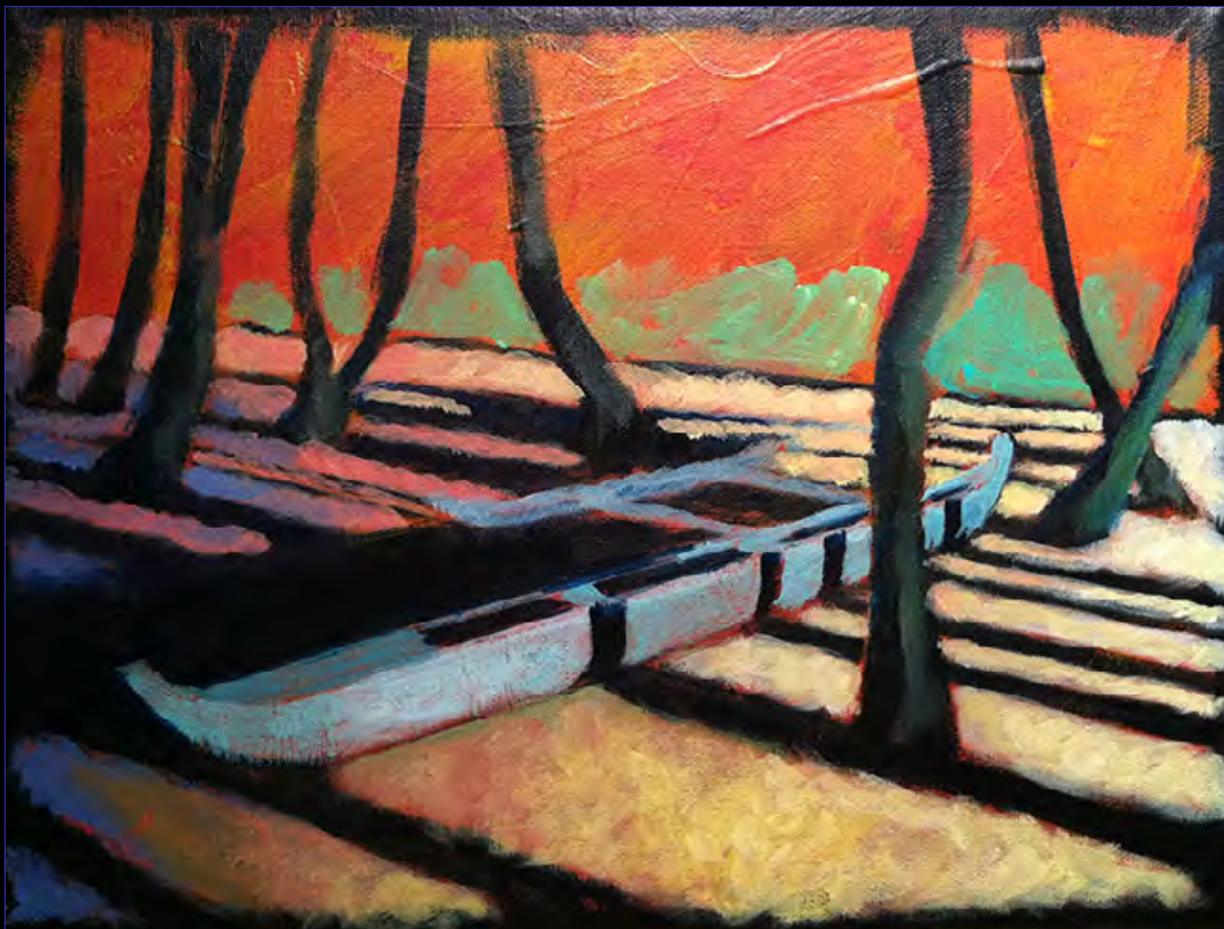
First color surfaces. Checking the light, where it comes from, the intensity....