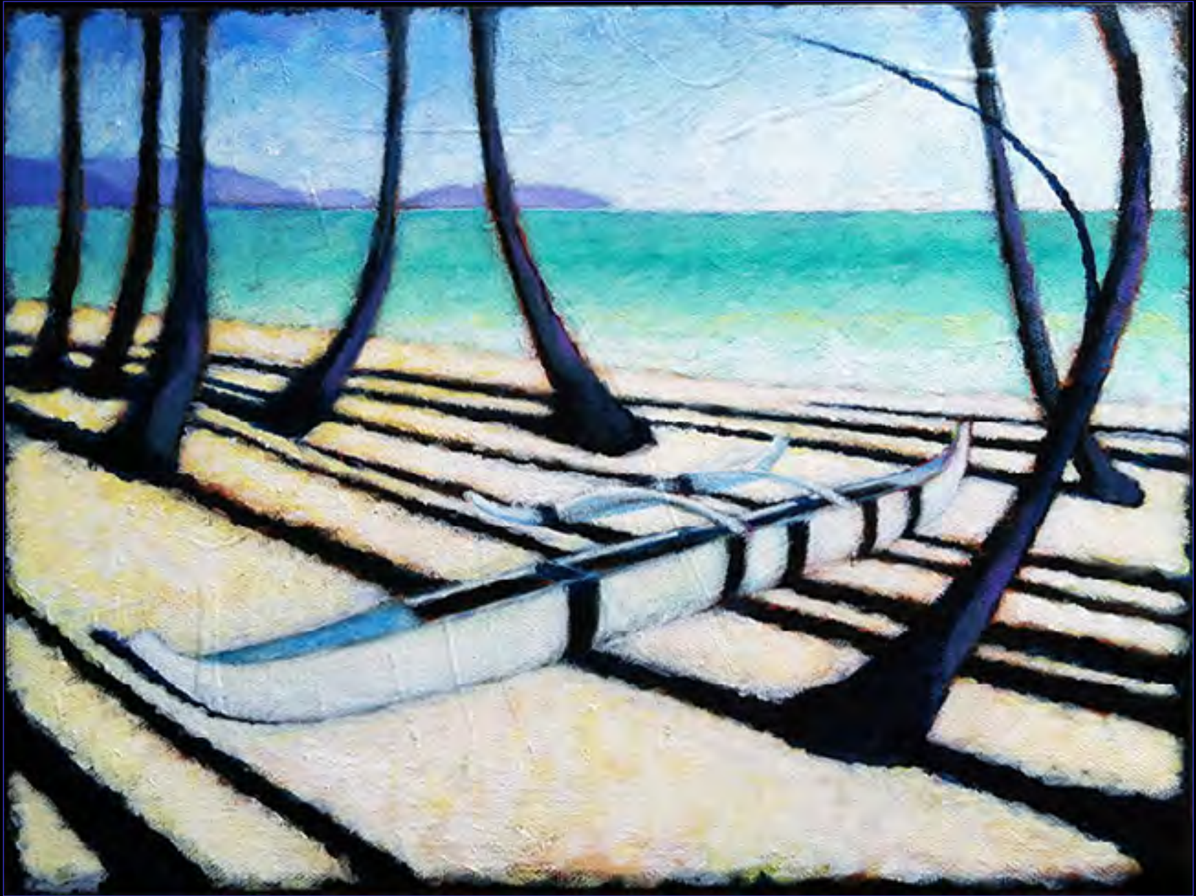
Blending the sands and the sky areas; complete the pontoon and struts; trying a coconut palm leaf....