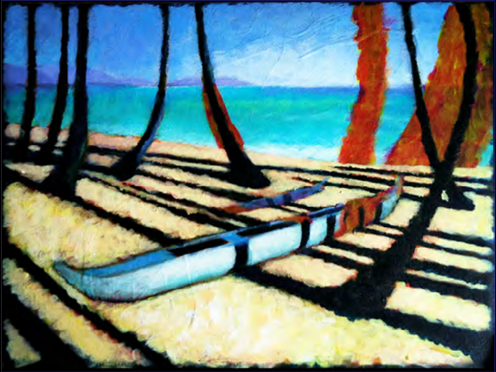
Removing the palm trees, making the sand lighter; pontoon sketch....